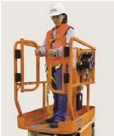
Saloon-style swing gate for ease of entry and exit.

Flashing amber beacon 1,000W – AC Inverter/charger