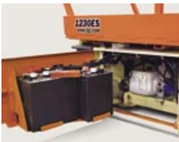
All-steel swing-out battery doors with heavy-duty hinges.